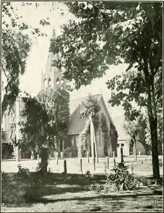
TRINITY CHURCH, 1903